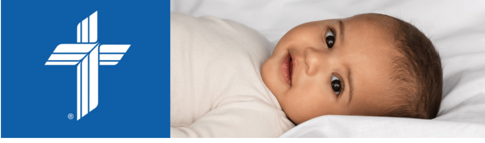
"This is the day that the Lord has made; let us rejoice and be glad in it" (Psalm 118:24).

Today is a monumental day, a day on which we simultaneously rejoice, pray, give thanks, lament, repent and weep. The Supreme Court reversed Roe v. Wade and returned the responsibility for protecting life to the states. "Held: The Constitution does not confer a right to abortion; Roe and Casey are overruled; and the authority to regulate abortion is returned to the people and their elected representatives" (SCOTUS, Dobbs v. Jackson, 1).