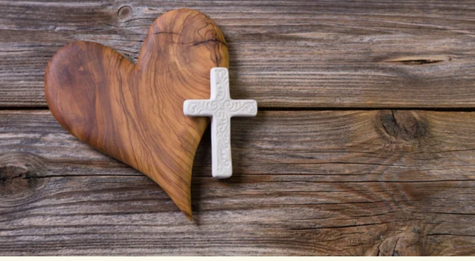
The Lutheran Church—Missouri Synod LCMS Stewardship Ministry Newsletter Article