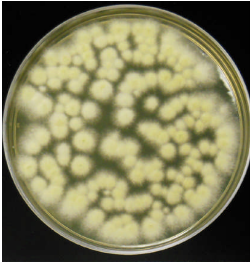
Pathogen growth from unfiltered contaminated air