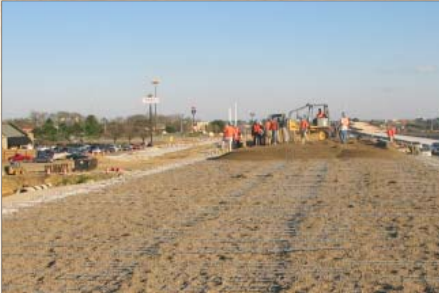
The consultant specified the lightweight aggregate instead of the normal structural fill often used in projects like this to reduce the density behind the wall.

normal weight backfill (around 115 lb per cu ft) would produce excessive stress on the low bearing capacity soils, which would lead to unacceptable settlements. Since the proposed retaining walls approached heights of 40 ft in some locations, a cost-effective solution needed to be found that addressed these circumstances.