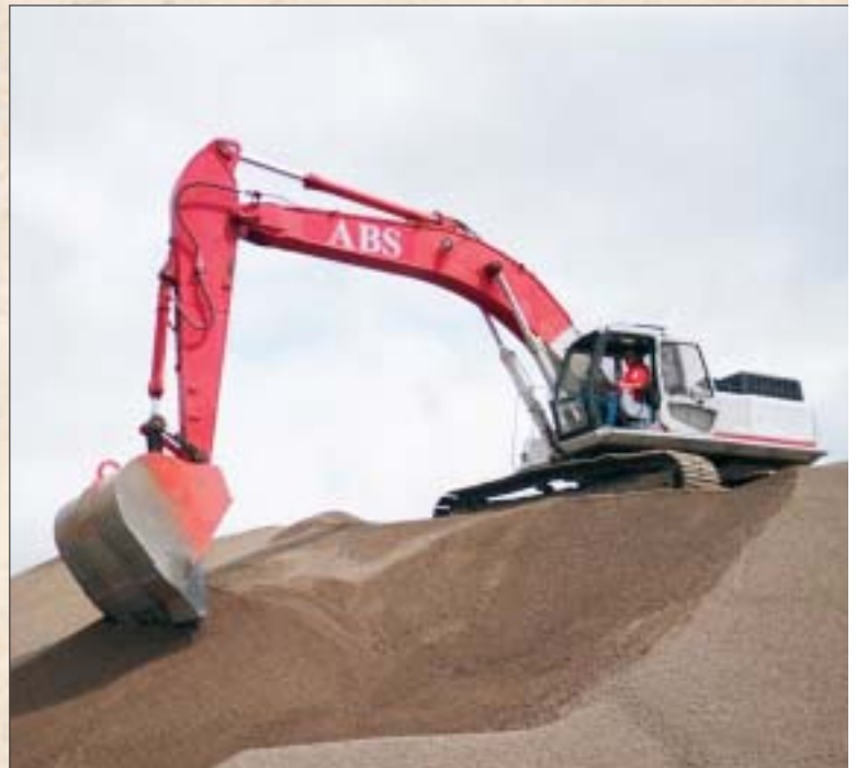
Manufactured in a rotary kiln that produces ceramic aggregate particles filled with air voids, the material is strong, durable, and lightweight.