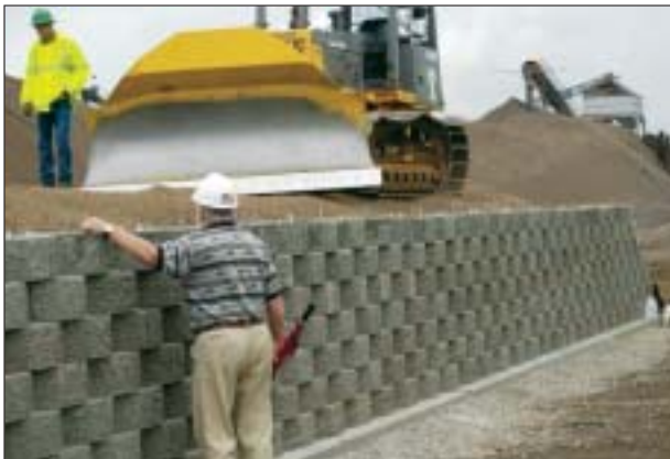
Lightweight aggregate was an excellent choice to use behind the retaining wall because it did not require expensive improvements to the ground.

During the design development phase, Professional Services Industries, Inc. (PSI, www.psiusa.com ), the project's geotechnical consultant, discovered low bearing capacity soils in the areas where retaining wall construction was necessary. PSI determined, through analysis of the existing soil conditions, that the critical wall height was about 22 ft. This finding meant that retaining walls taller than 22 ft and built using