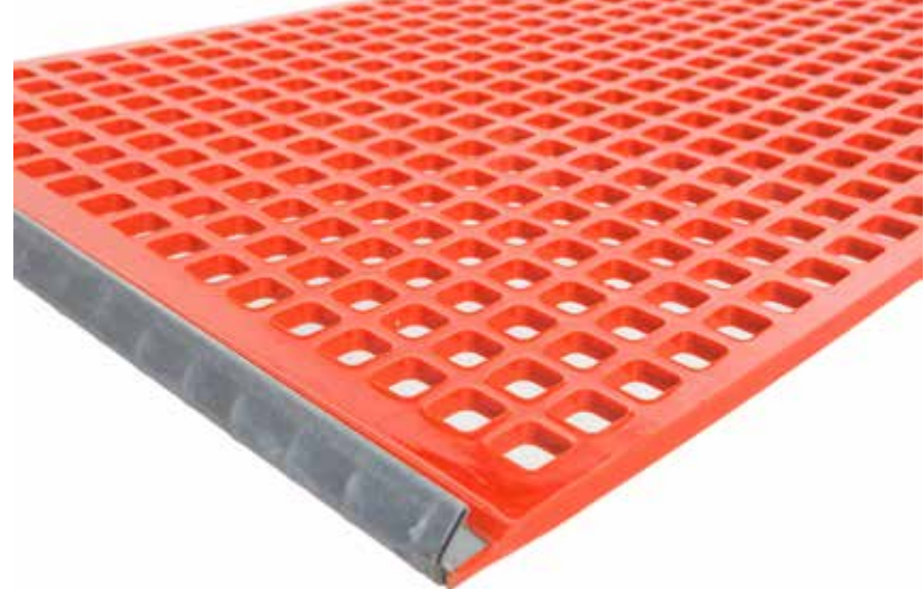
Durex® Armor® Screen Media

Economical, versatile and easy to install; the Armor® screen is designed to increase throughput and reduce plugging. Combined with a high grade woven wire back-bone, it creates a strong highly wear resistant screen.