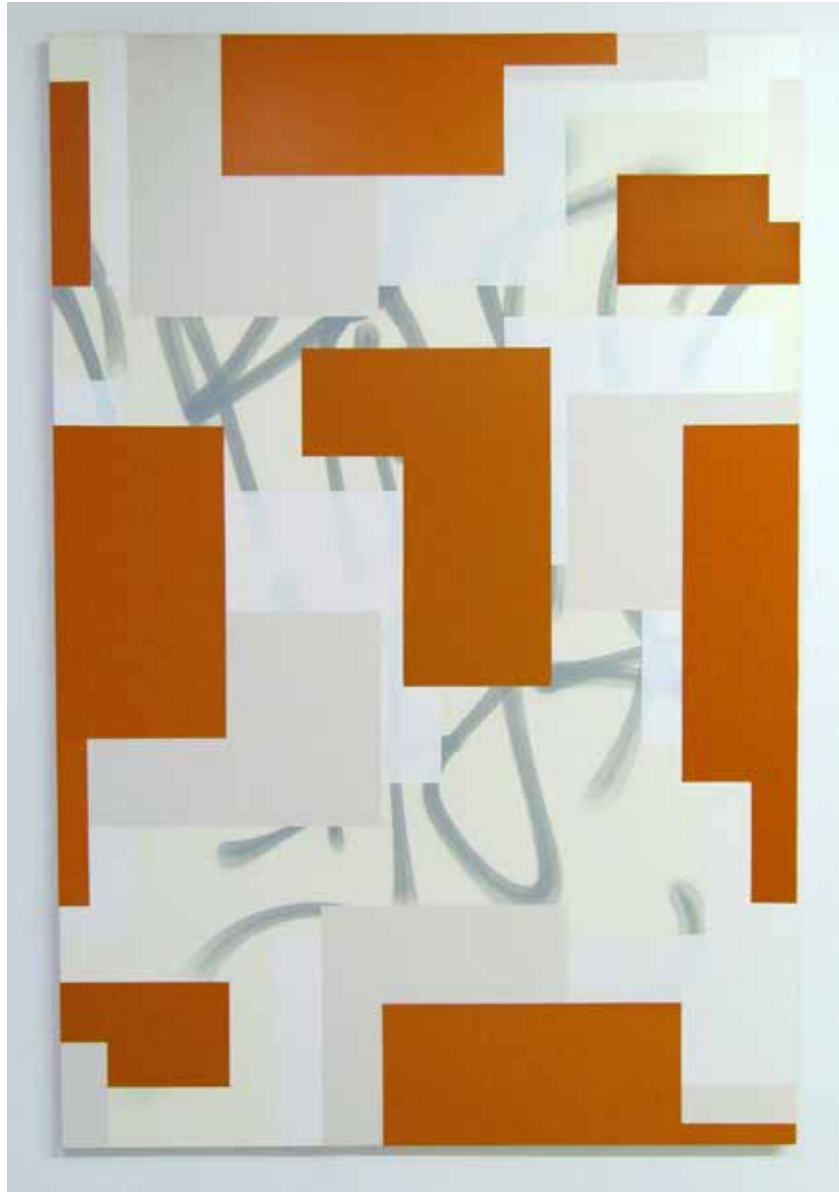
Karlos Cárcamo Hard-Edge Painting #106, 2010 Latex and spray enamel on canvas over wood panel 72 x 48 inches