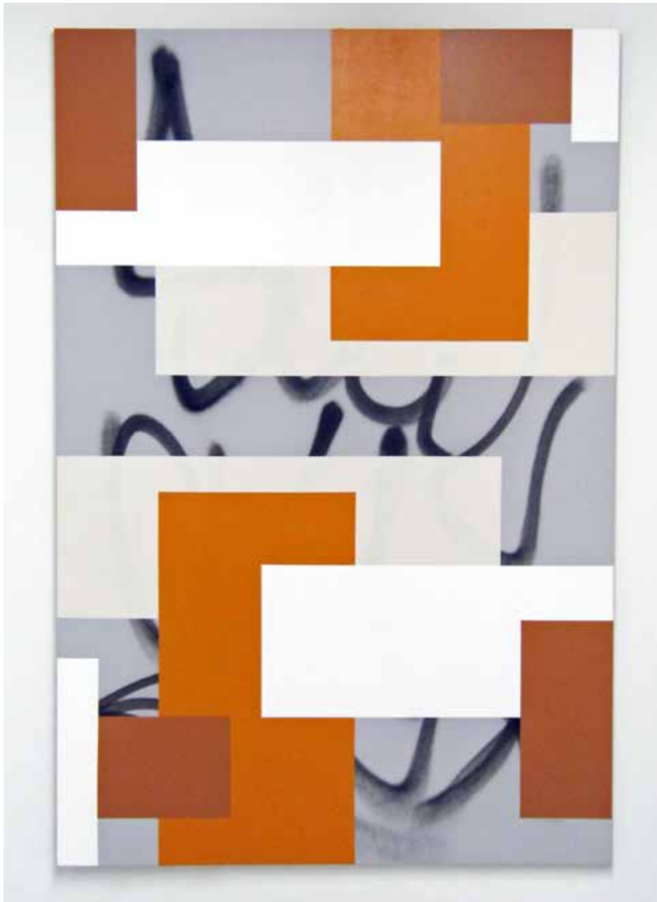
Karlos Cárcamo Hard-Edge Painting #124, 2012 Latex and spray enamel on canvas over wood panel 72 x 48 inches