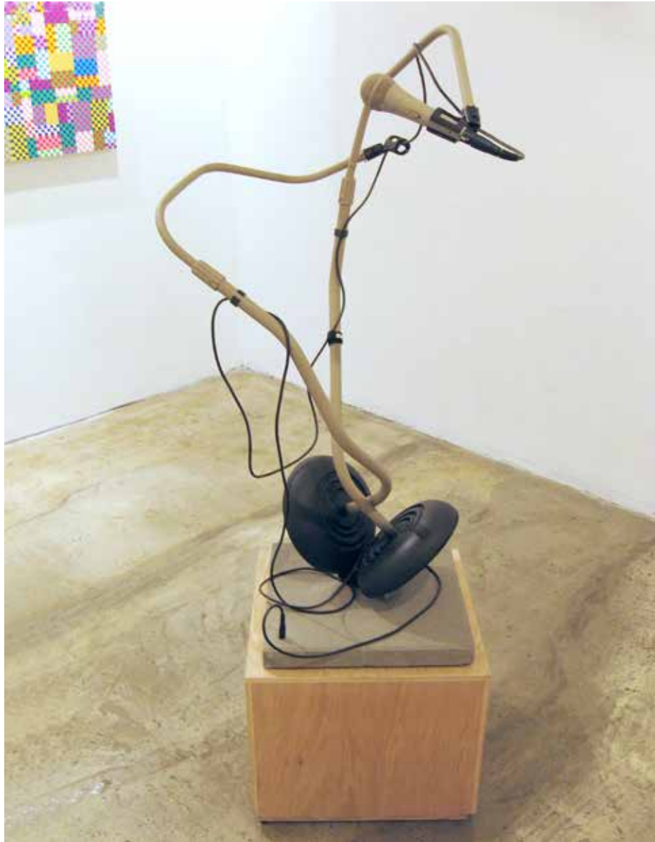
Karlos Cárcamo Funky Fresh, 2017 Microphone stands, cables, stone flake paint, concrete, mirrors, plywood pedestal 60 x 18 x 18 inches