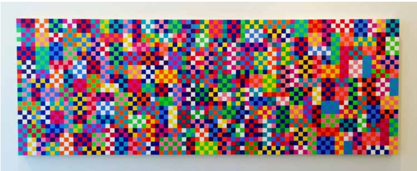
Robert Otto Epstein Two Thousand Five Hundred Twenty Squares, 2017 paint on panel 30 x 84 inches