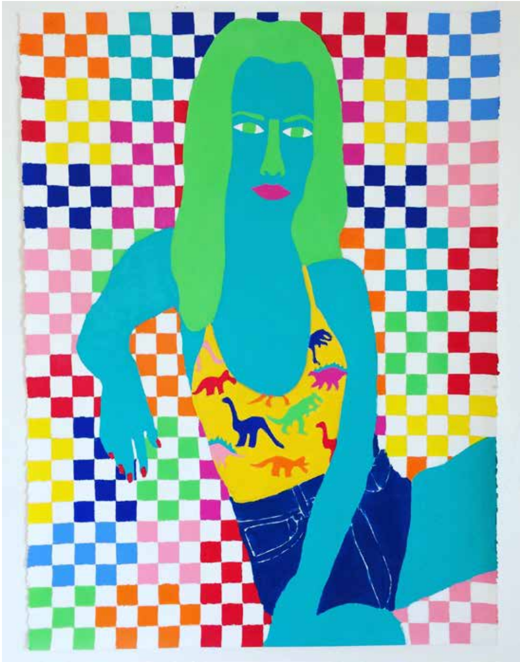
Robert Otto Epstein Emily Ratajkowski, 2017 paint on paper 30 x 22 inches (framed)