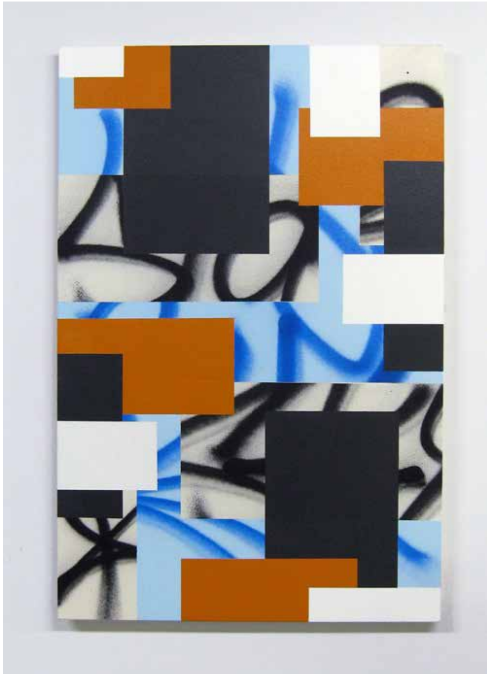
Karlos Cárcamo Hard-Edge Painting #132, 2013 Latex and spray enamel on canvas over wood panel 36 x 24 inches