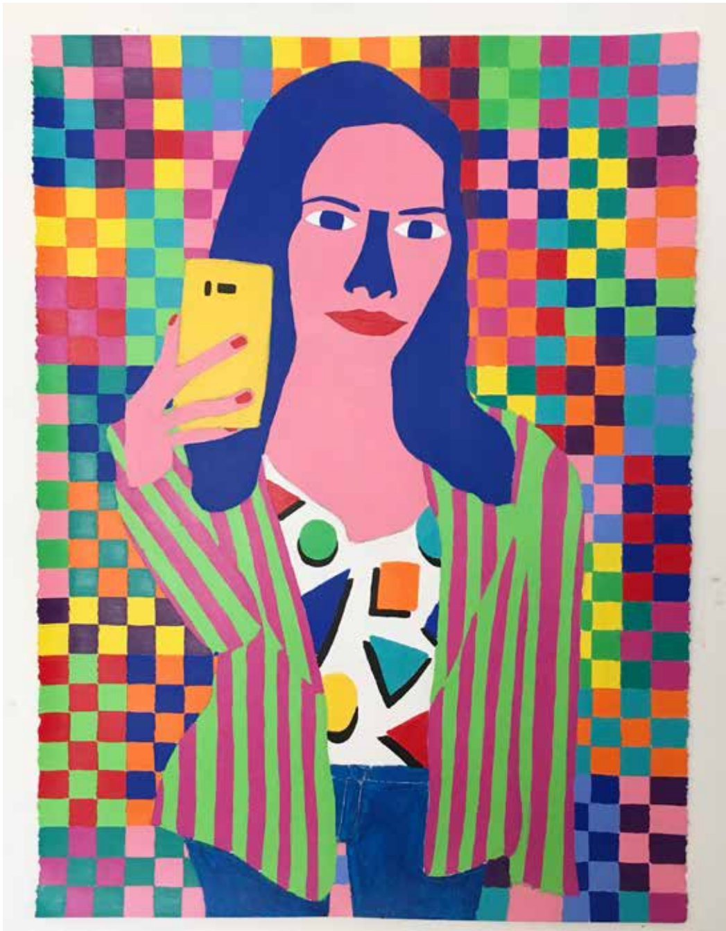
Robert Otto Epstein Olivia Munn, 2017 paint on paper, 30 x 22 inches (framed)