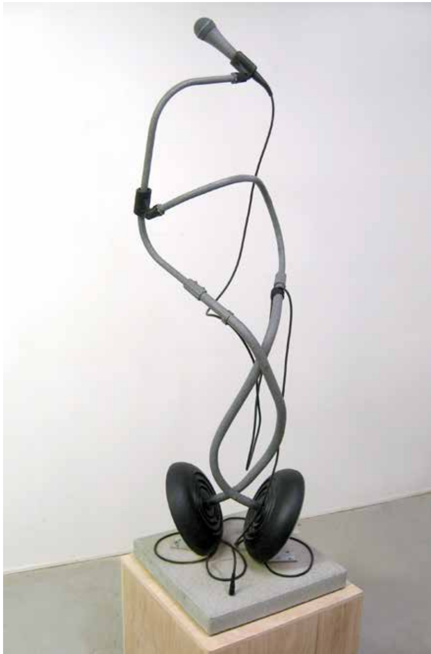
Karlos Cárcamo on the one and two, 2015/17 Microphone stands, cables, stone flake paint, concrete, mirrors, plywood pedestal 70 x 18 x 18 inches