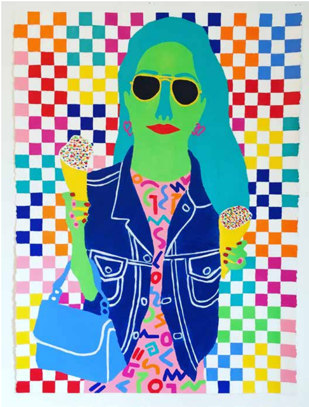
Robert Otto Epstein Negin Mirsalehi, 2017, paint on paper 30 x 22 inches (framed)