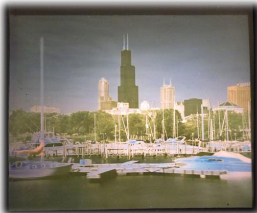
Sear's Tower, Chicago (1997)