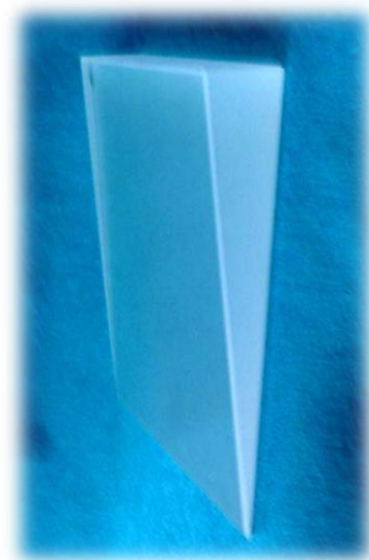
Glass wedge on top of the plate