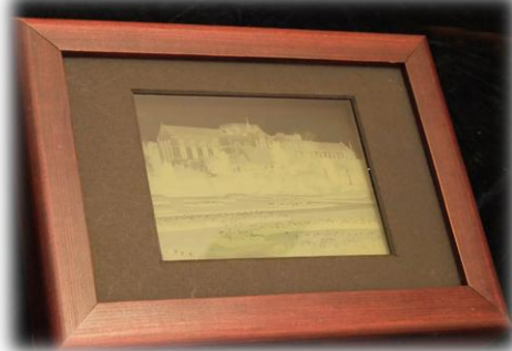
Abbey Garden (2000)

This how the framed Lippmann photographs looks like