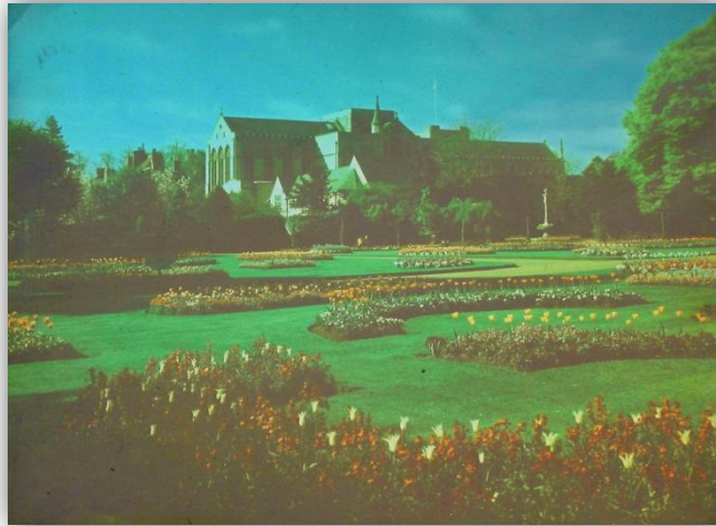
Abbey Garden (2000) Image size: 8" by 10" (20 x 25 cm) £ 650.- unframed with no wedge

Lippmann photograph recorded at Abbey Garden in Bury St. Edmunds, UK. It is not covered with a prism and not framed. This plate demonstrates how a Lippmann plate works. Please, note the emulsion side is facing you when you look at it. Be careful not to damage the emulsion. This large plate was one of the recorded plates by Hans Bjelkhagen and Darran Green on 1 May 2000. When not using mercury it is much easier to record large Lippmann photographs, Recording data: aperture f/11, exposure time 3 minutes on a Slavich PFG-03c glass plate. The plate was developed in the holographic GP8 developer. This plate comes with a glass plate to be used when stored.