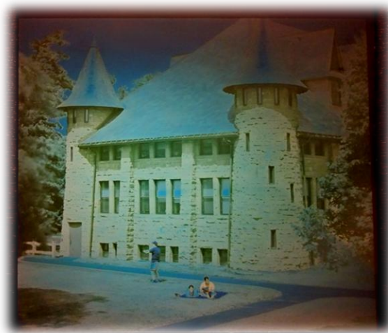
Hotchkiss Hall (1997)

Lippmann photograph is a plate of a stuffed parrot which is not covered with a prism and not framed. This plate demonstrates how a Lippmann plate works. Please, note the emulsion side is facing you when you look at it. Be careful not to damage the emulsion. Protect it with a glass plate when stored.