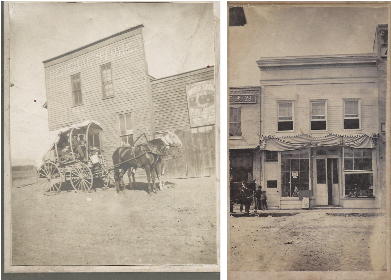
America's First "General Stores"

As towns expand, other venues open up -a saloon, an inn, a stables, possibly a jail, eventually a post office.