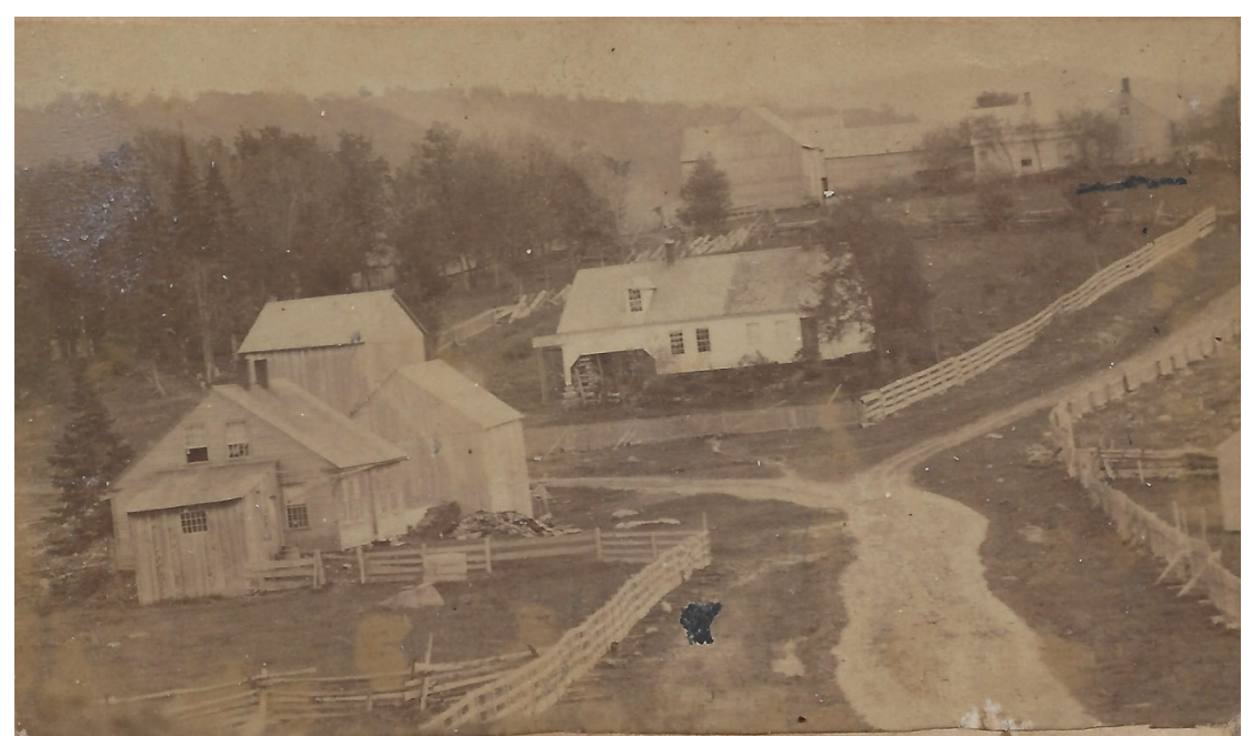
A Prosperous Rural Setting in Connecticut

In 1820, the vast majority of Americans – over nine in ten – still live in the country, on farms.