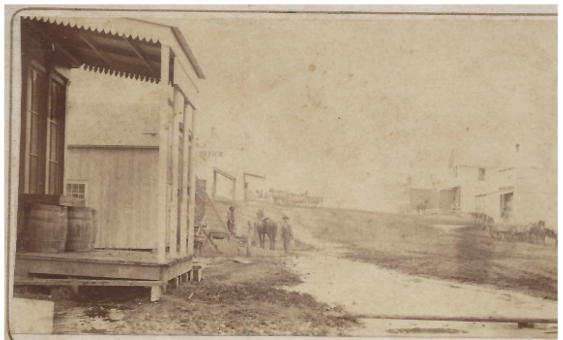
A Small Town in America: Circa 1820.

At the intersection of these roads, small towns form up.