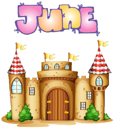
In class we are working on several concepts to promote social and independent skills.