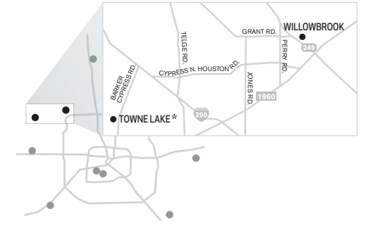
*Towne Lake offers screening mammograms only