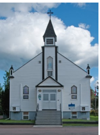
Our Lady of Mercy 11 St. Andrews Street Pointe-du-Chêne, NB E4P 5E4