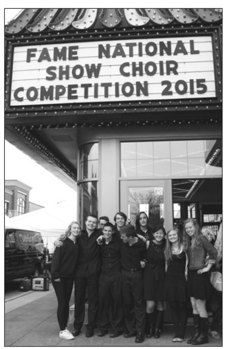
ATSC band members catch a photo op under the FAME marquee.

enthusiastic response. On stage and off, these young men and women are a shining example of what is right about today's youth."