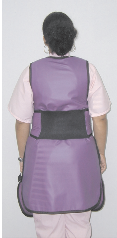
THE JACKET APRON

Our JACKET apron was designed by Pulse for optimal protection. Your comfort is also a primary concern so a wide support belt and shoulder pads are standard. Each front panel is .5mm Pb. equiv. An embroidered pocket is also included.