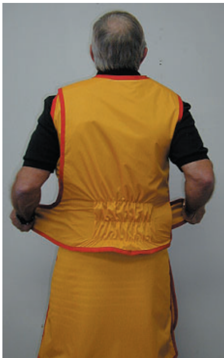
THE SLOT STRETCHY BACK APRON

While still getting full protection, our customer also receives Pulse's lightest vest. This design incorporates back lumbar support with elastic in the back. The SLOT STRETCHY BACK , allows the customer to adjust for maximum comfort. We include shoulder pads, pocket and embroidery