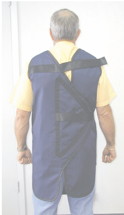
THE BACK CLOSE WRAP JACKET

The BACK CLOSE WRAP is our lightest full protection jacket. As an improvement, this style has a strap across the shoulders to hold them in place. For a more secure fit, we added front buckles. An embroidered pocket and shoulder pads are also included.