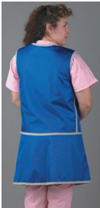
THE TWO PIECE APRON

When full protection becomes important, the TWO PIECE should be your choice. Two pieces add to your comfort through more efficient distribution of weight. Each front vest panel is .5mm Pb. equiv. The vest comes with shoulder pads, pocket and embroidery. The skirt has hanging loops as well as an attached belt to tighten the waist. For a smaller waist, we can sew elastic in the back of the skirt