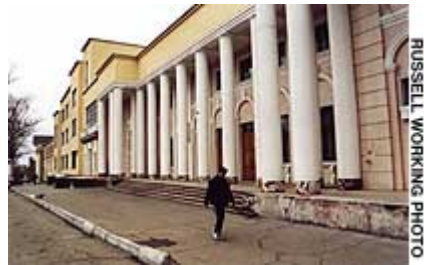
Site of the Khabarovsk Trial