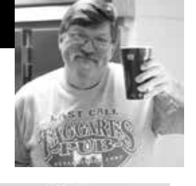
Hope you were there - It was a good time!