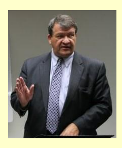
State Senator George Latimer Speaks at October Event