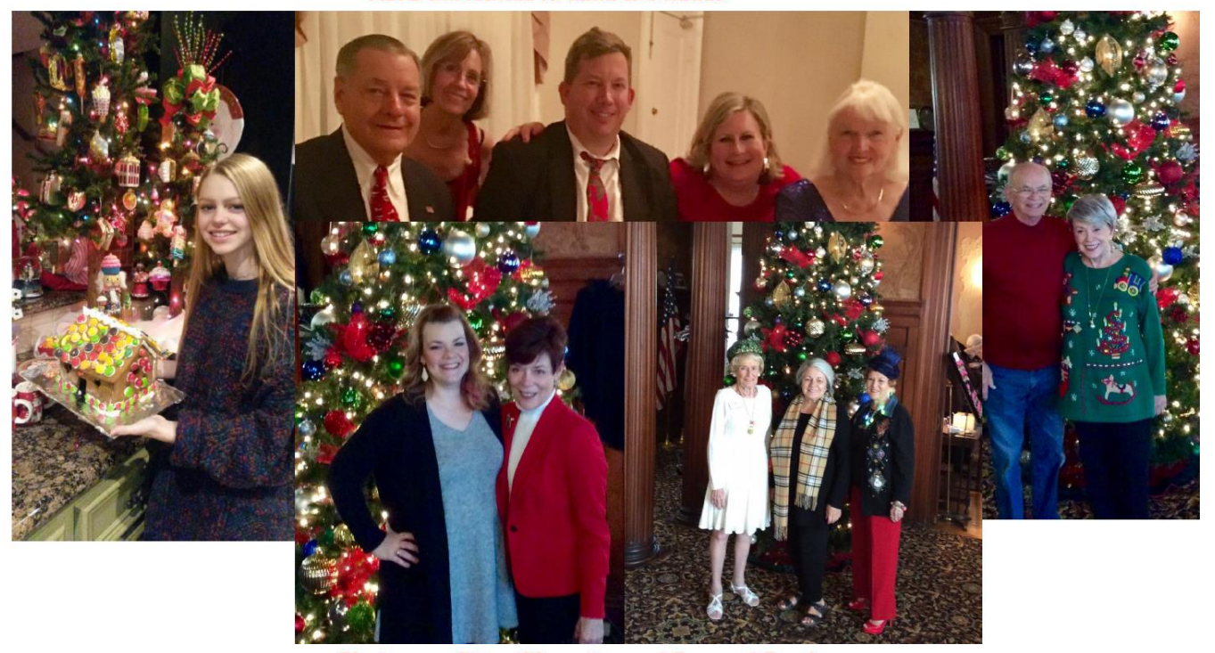
Christmas Faire Shopping and Fun and Food