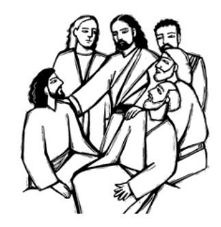
Calling the Twelve to him, he sent them out two by two. Mark 6:7 (NIV)