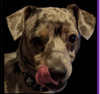
"Gregg" the escape artist

Blue jays. I thought this was neat! A first occurrence for me, as we typically only see robins!