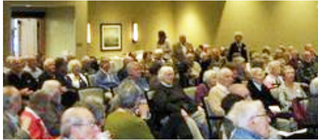
WACCRA Meeting Hosted at Timber Ridge