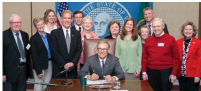
Governor Jay Inslee signs RCW 18.390

Your membership fees help offset the printing costs for the Consumer Guide to Continuing Care Retirement Communities in Washington State prepared by WACCRA.