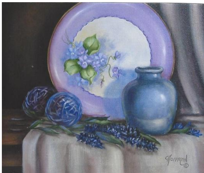
6 hours - Carol Hoffman "Lavender Blue Still Life"