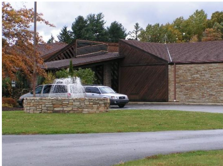
Main Building. Check in here.