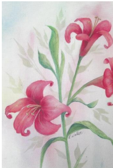
6 hours - Elaine Walker "Trumpet Lily"