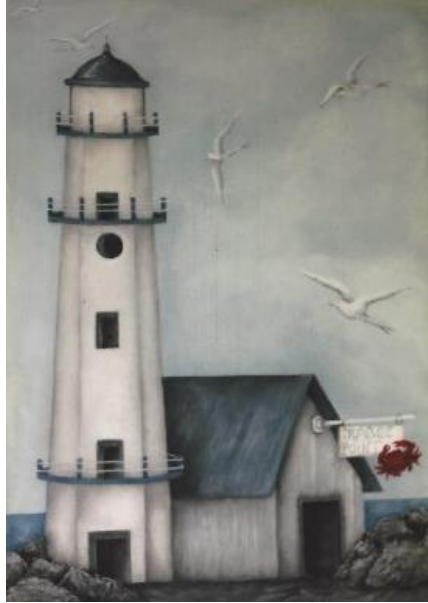
6 hours - Viki Sherman "Crabbe Point Lighthouse"

Saturday, October 12 9:00a.m. – 12:00p.m. and 1:00p.m. – 4:00p.m.