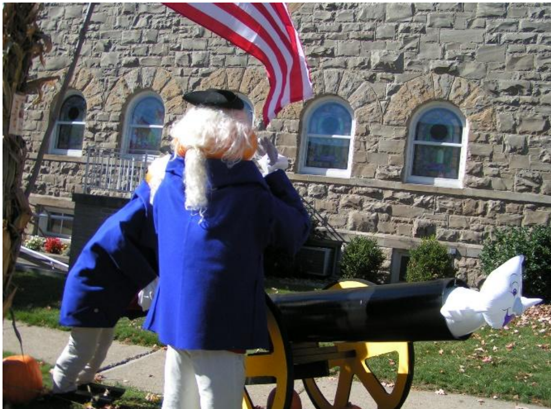
Remember Ligonier Days