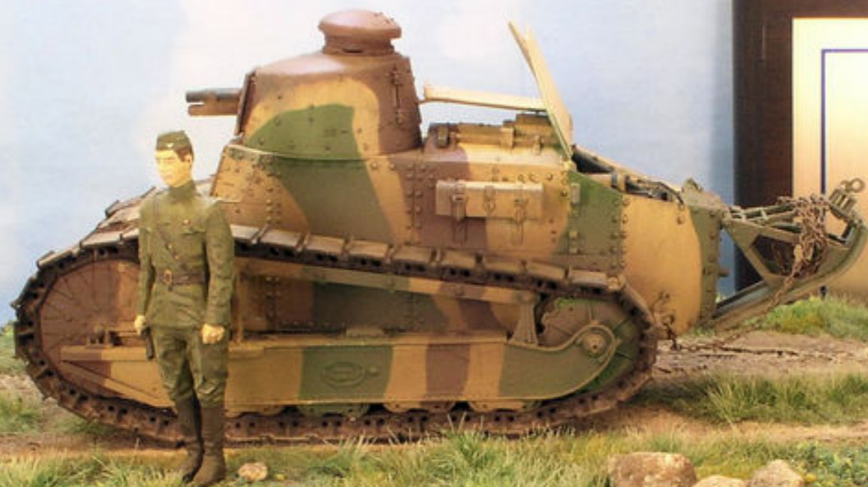
French FT-17 Light Tank France 1918

EVERY MODEL TELLS A STORY COLUMBIA 2016 THE IPMS/USA NATIONAL CONVENTION