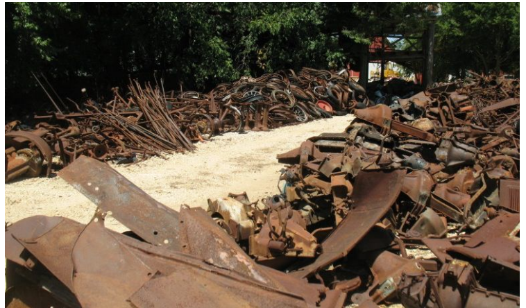
That part may be hiding right before your eyes!