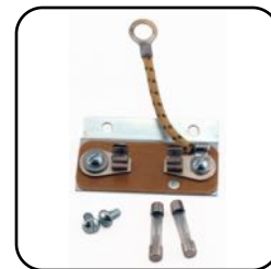
Retro at Model A parts suppliers