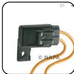
NAPA part # NW784623

switch. These parts might add another $1.25 or so to the assembly. You probably will spend less than $5.50 for this as opposed to around $11.00 plus shipping from a Model A parts supplier. Purchase a few extra fuses to keep in the car, most people I've seen use either a 25 or 30 amp rated fuse. Either way please use a fuse to save your car from potential damage.