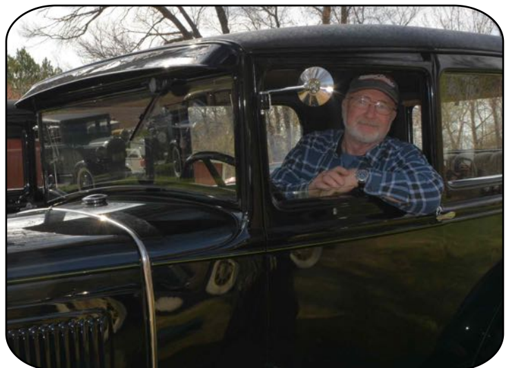
Finally behind the wheel of his own Model A