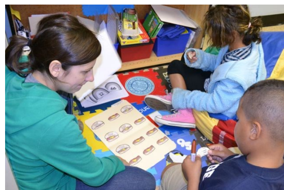
A staff member works with Centennial Students. Centennial has dramatically reduced restraints & seclusions, from over a thousand in 1997-98 to just 3 last year.

The Centennial School stands as evidence that restraint and seclusion can be virtually eliminated in schools—even for kids considered to be the "worst of the worst." It is our attitudes, as adults, that drive our interactions and our interventions. While the institutional culture promotes the use of restraint and seclusion, they will continue to be seen as necessary. When the culture changes, outcomes, behaviors, and lives change.