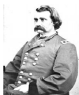
General John A. Logan

By the late 1800s, many communities across the country had begun to celebrate Memorial Day and, after World War I, observances also began to honor those who had died in all of American's wars. In 1971, Congress declared Memorial Day a national holiday to be celebrated the last Monday in May. (Veterans Day, a day set aside to honor all veterans, living and dead, is celebrated each year on November 11.) Today, Memorial Day is celebrated at Arlington National Cemetery with a ceremony in which a small American flag is placed on each grave. Also, it is customary for the president or vice-president to give a speech honoring the contributions of the dead and lay a wreath at the Tomb of the Unknown Soldier . About 5,000 people attend the ceremony annually.