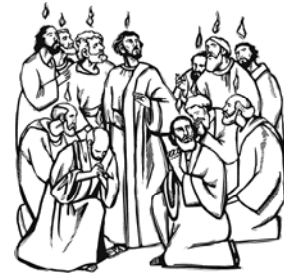
The Holy Spirit Descends on Pentecost

Each month of the Daily Bible Reading Guide will be in the monthly newsletter.