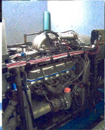
The Bonneville Car