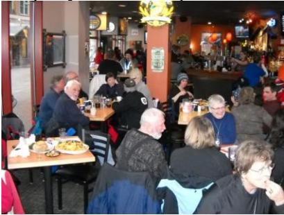
The Gang enjoying hot apps and cold beer

Great condos and several Red Eye Perks, like a welcome dinner, pizza party, and an après ski party at 9280' tap house in River Run Village, gave us plenty of time to interact.