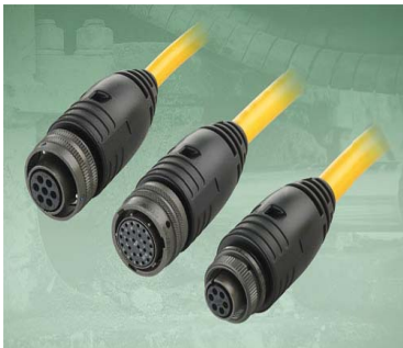
OVER MOLDING & POTTING