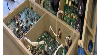
RACK & PANEL / BOX / PANEL BUILD