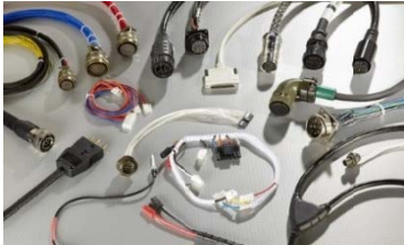
CABLE AND HARNESS