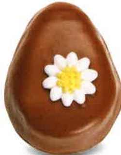
Chocolate Butter Egg Creamy and delicious. 3 oz $6.50 #9500