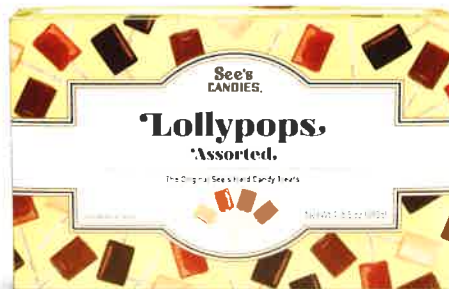
Assorted Lollypops Vanilla, Butterscotch, Café Latté and Chocolate. Approximately 30 per box. 1 lb 5 oz $19.00 #296 MSRP