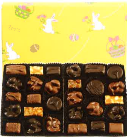
Nuts & Chews Yummy, crunchy and chewy. Delivered in seasonal wrap. 1 lb $19.90 #334