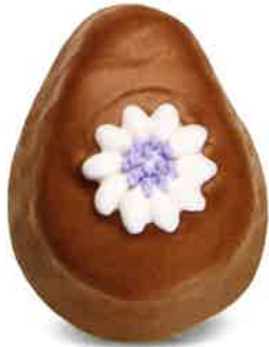
Peanut Butter Egg An irresistible treat. 3 oz $6.50 #9499