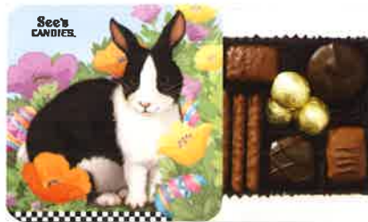
Bunny Delight Box Full of See's favorites. 4 oz $7.50 #927