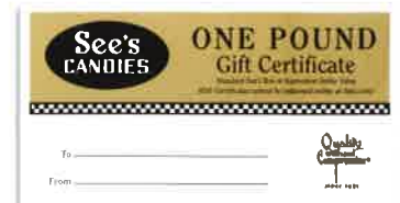
Gift Certificates Redeemable at any See's Candies shop. 1 lb $19.90 #767 (redeemable continental U.S.) 1 lb $21.50 #769 (redeemable Hawaii)