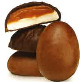
Marshmallow & Scotchmallow® Eggs Four yummy eggs. 3.4 oz $6.50 #9493