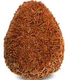
Bordeaux™ Egg Our most popular flavor. 3 oz $6.50 #9501