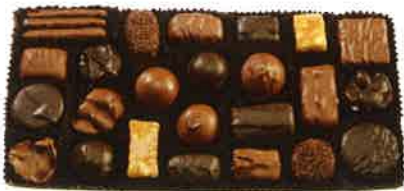
Assorted Chocolates Milk and dark decadence. Delivered in seasonal wrap. 1 lb $19.90 #318