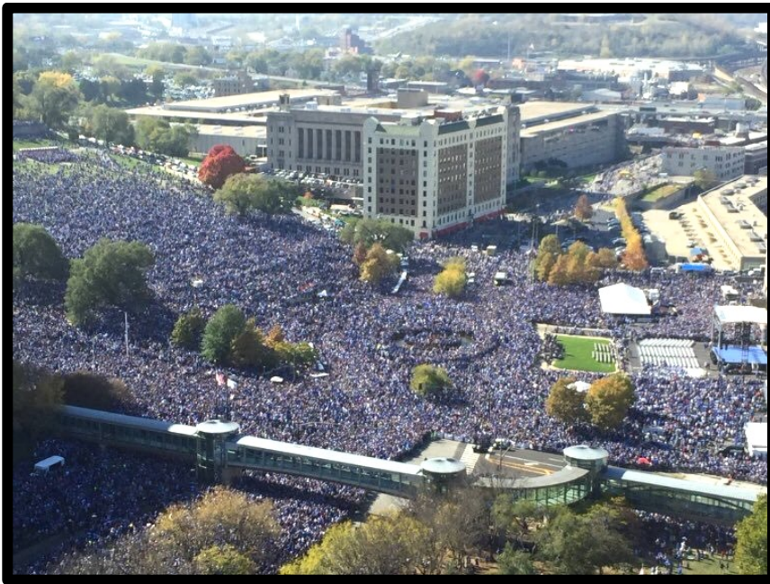
Cubs victory parade, Grant Park, Chicago after winning 2016 World Series—Crowd estimate 5 million