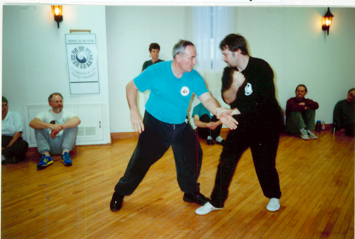
2- Person Applications