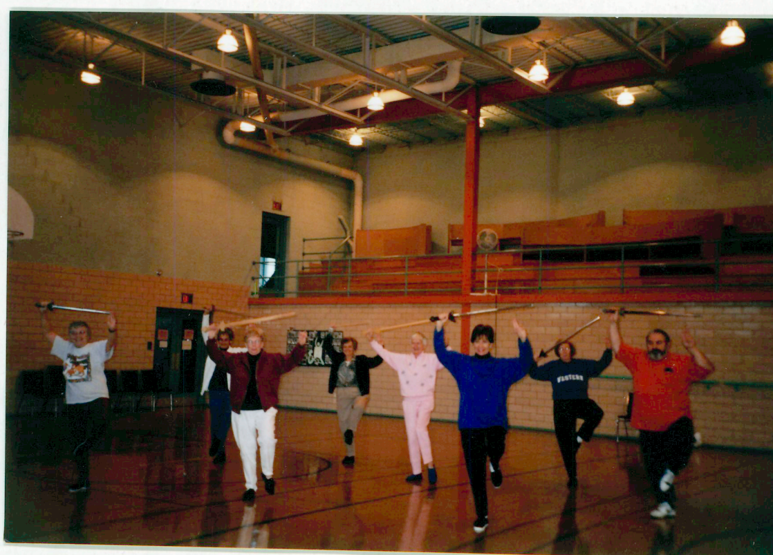
Centre for Activity and Aging- 1999