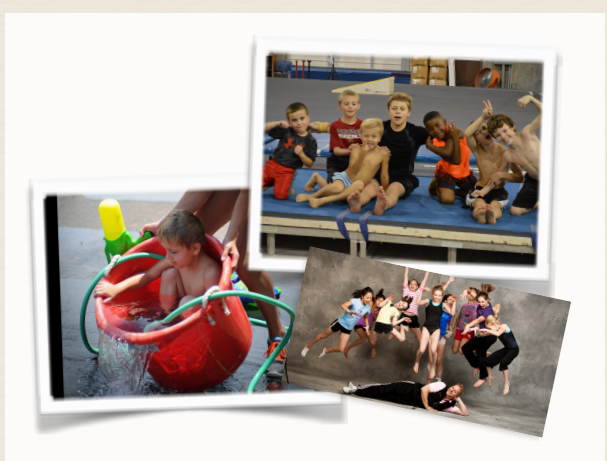
Enjoy Summer Camp in Sunny Arizona!!