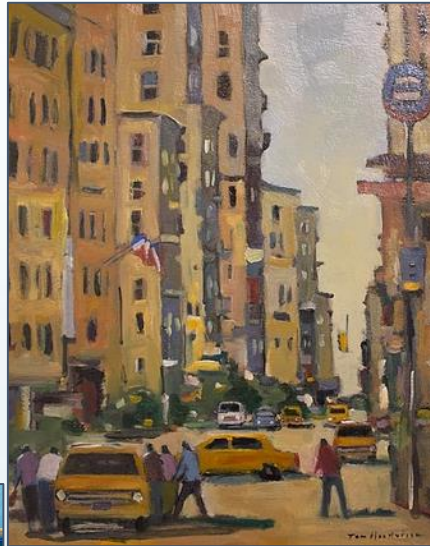
Yellow Cab NYC by Tom Henderson