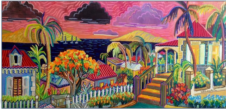
Historic Charlotte Amalie