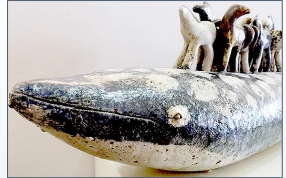
Spotted Grey with Herd by Larry Carnes