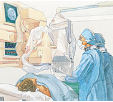
Monitors let the doctor follow the catheter's progress during the procedure. Before the Procedure

Insertion sites may be in the groin or the arm.