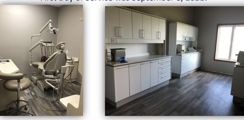
300 Dental Clients were Served in 2021.