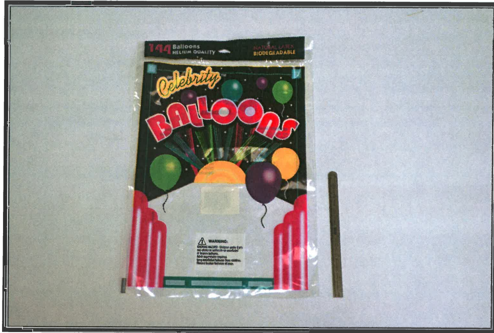
Figure 2: Empty Poly Bag with UPC label