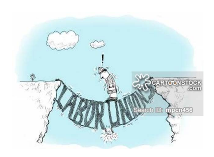
Page 5 www.nteu.org