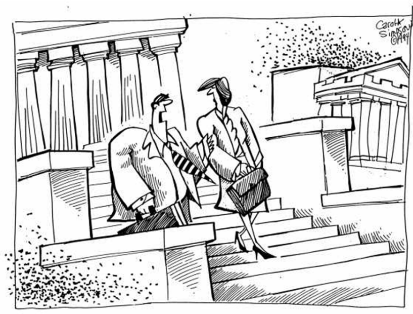
"Labor law reform is supported by millions.... unfortunately that's people, not dollars."