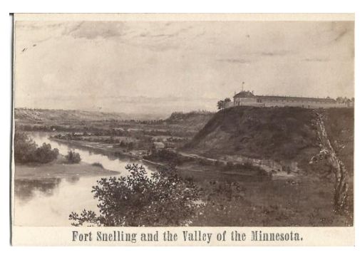
A Typical Fortress Guarding a River

On the same day the Second Continental Congress convenes to map out a unified strategy, an independent band of New Hampshire militiamen known as The Green Mountain Boys capture Ft. Ticonderoga, at the southern tip of Lake Champlain, some 300 miles northwest of Boston.