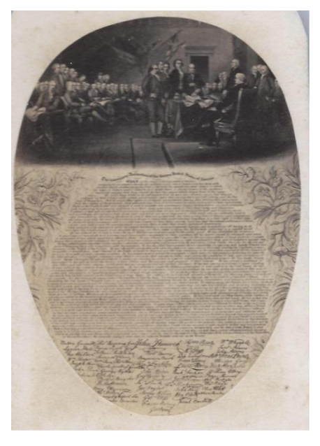
Signing the Declaration of Independence

The move is reinforced by a widely circulated pamphlet titled Common Sense, written by Thomas Paine, formerly a disgruntled tax collector in Britain.