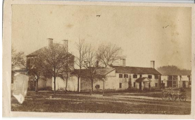
HQ of Price & Birch, Slave Dealers of Alexandria, Va.