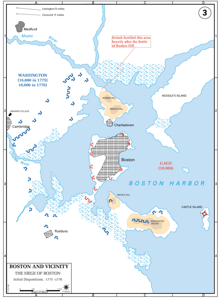
Gage's Forces Surrounded the City of Boston