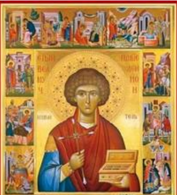
Gr. Martyr and Healer St. Panteleimon