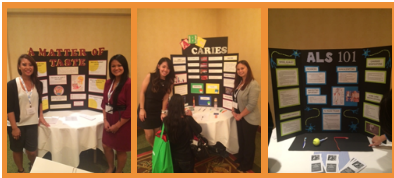
Top 3 table clinic winners. Congratulations!!