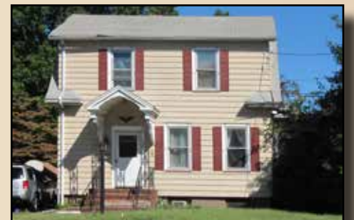
15 44 Freeman Street