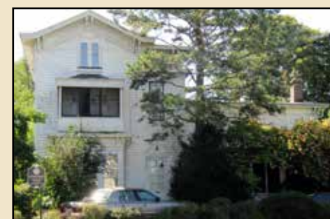
12 125 Freeman Street