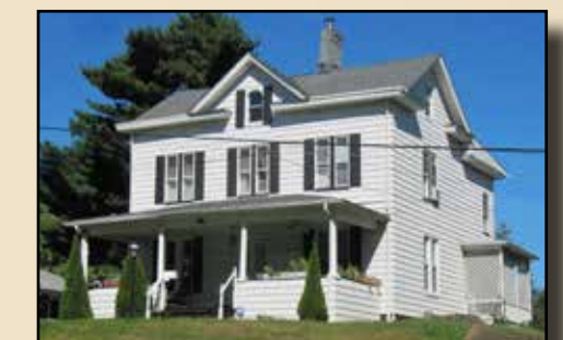
14 86 Freeman Street