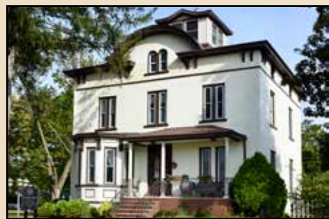
9 150 E. Prospect Avenue