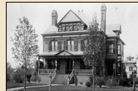
13 611 Barron Avenue (c.1920)