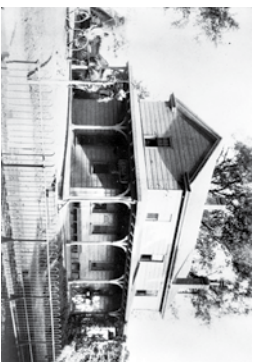
Edgar Train Station