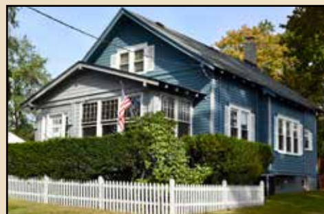
10 154 E. Prospect Avenue