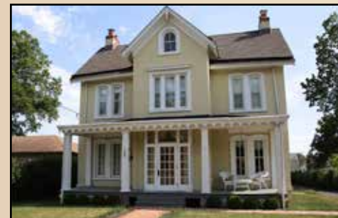
8 157 E. Prospect Avenue