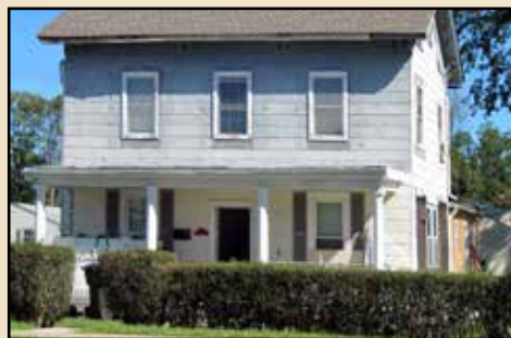
11 184 Freeman Street