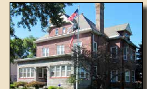
611 Barron Avenue (present day)