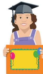
Cradle Roll Graduation