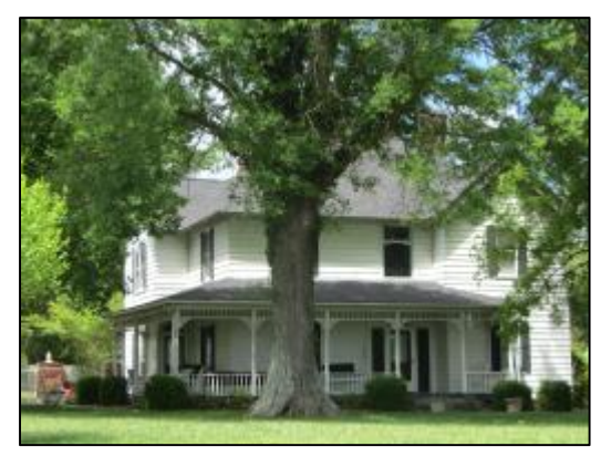
NCDOT Survey #29, Cyrus Augustus Wharton House (GF-2121), looking northeast.

Location and Setting: The Cyrus Augustus Wharton property is located on the north side of two-lane US 70 (Burlington Road) (Figures 41–49). The surrounding landscape, formerly rural and agricultural, currently is made up of a mix of modern commercial and residential buildings. A bank and parking lot are located to the west, and a modern residential subdivision is across the road to the south.