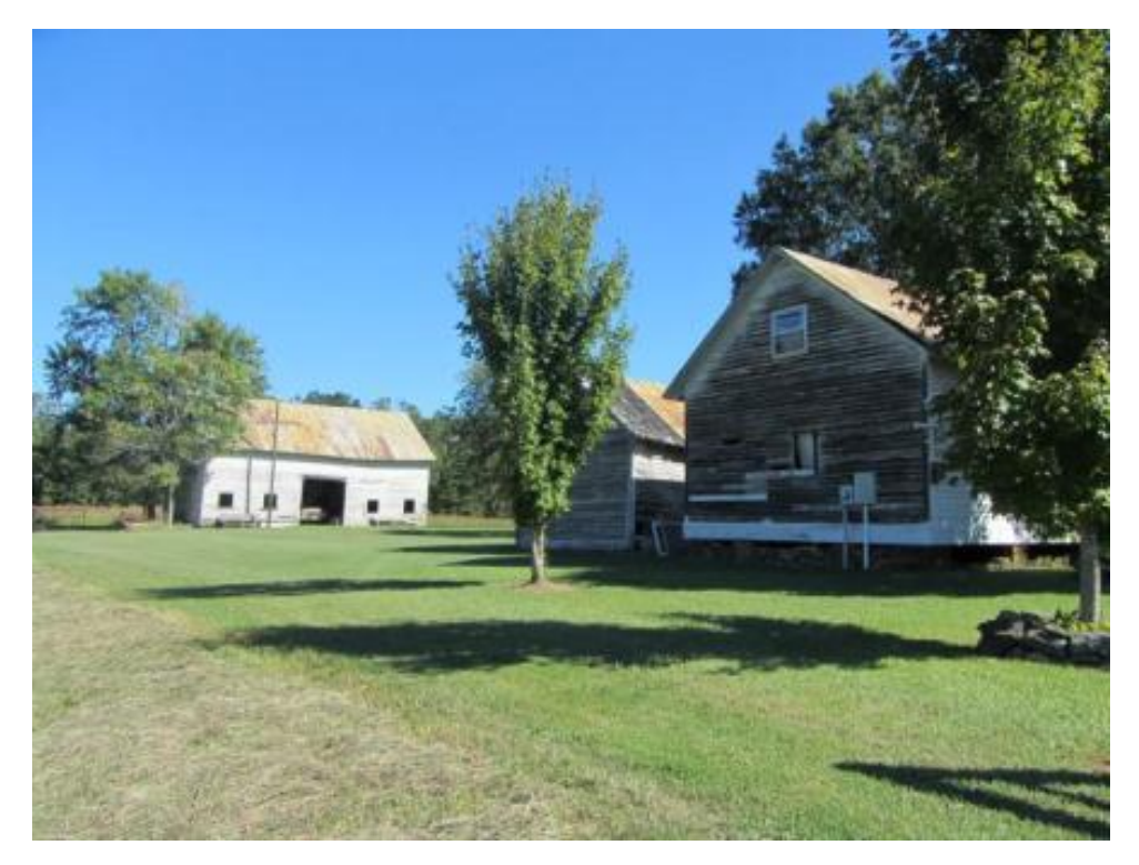
Figure 46. NCDOT Survey #29, Cyrus Augustus Wharton House (GF-2121), 6709 Burlington Road, Guilford County, (left to right), barn, vehicle shed, and domestic outbuilding, looking north.