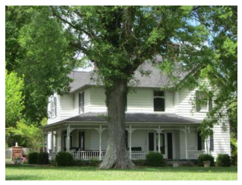
Figure 43. NCDOT Survey #29, Cyrus Augustus Wharton House (GF-2121), 6709 Burlington Road, Guilford County, south façade looking northeast from front lawn.