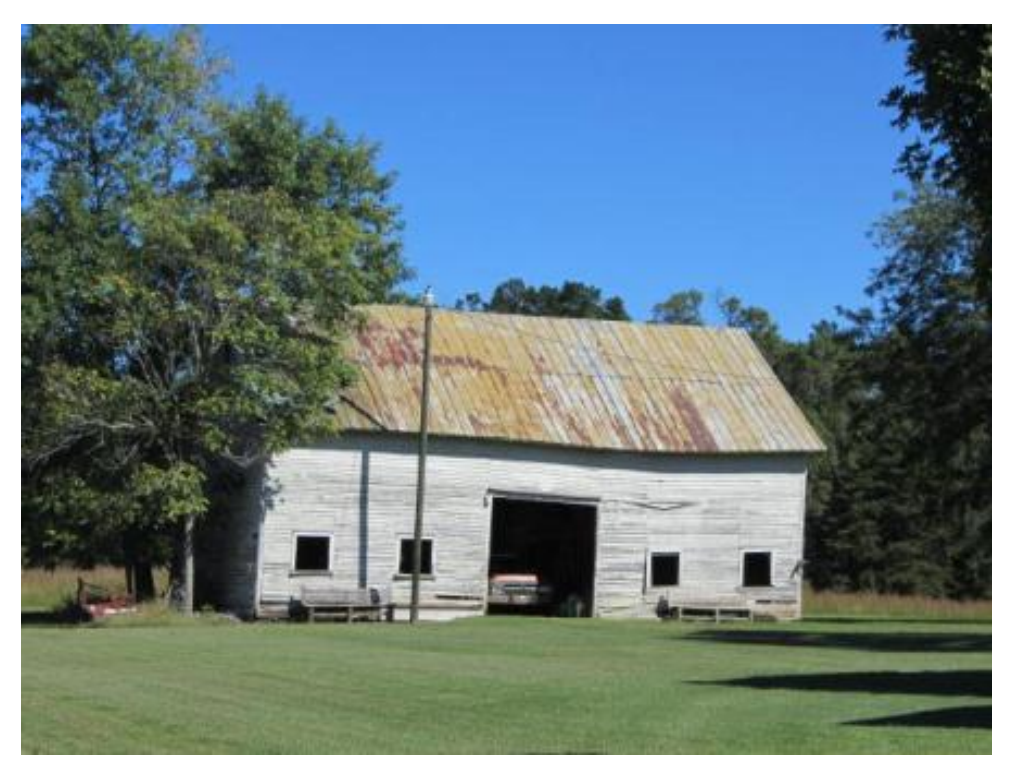
Figure 47. NCDOT Survey #29, Cyrus Augustus Wharton House (GF-2121), 6709 Burlington Road, Guilford County, barn, south side looking north.