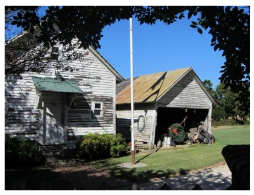
Figure 45. NCDOT Survey #29, Cyrus Augustus Wharton House (GF-2121), 6709 Burlington Road, Guilford County, domestic outbuilding and vehicle shed located northwest of the main house, looking northwest.