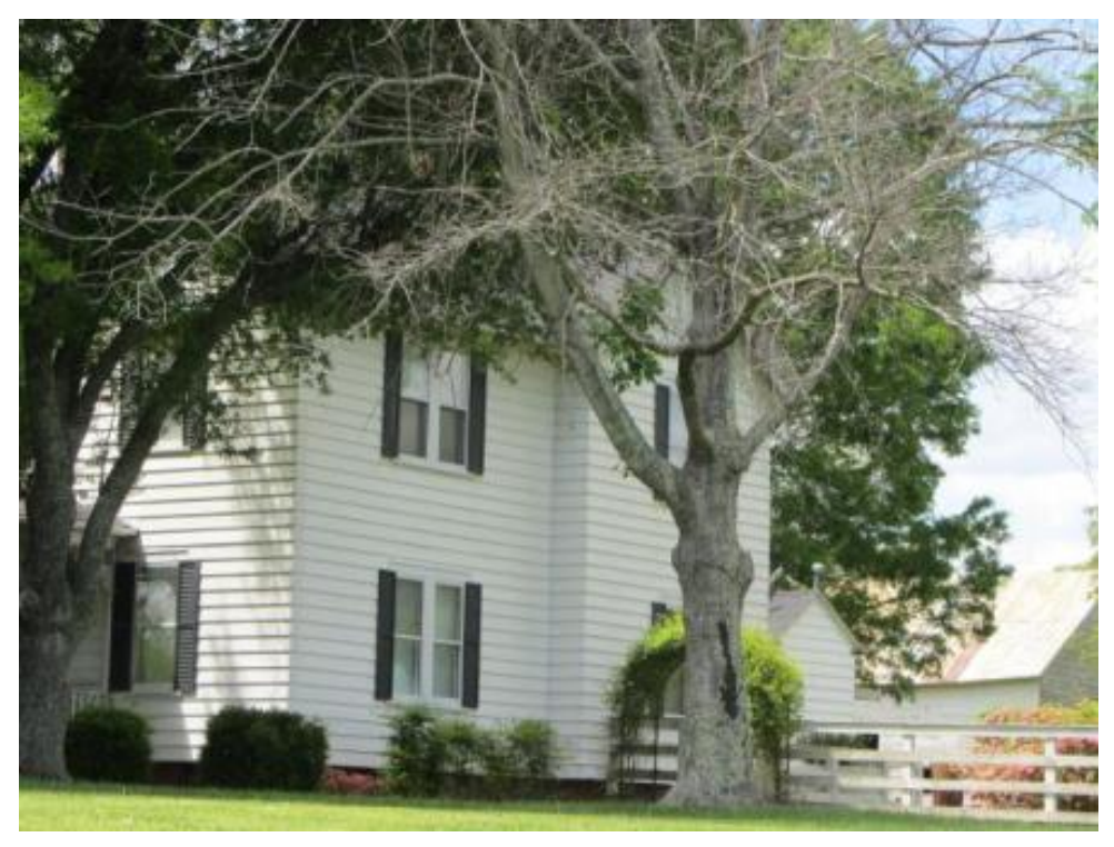
Figure 44. NCDOT Survey #29, Cyrus Augustus Wharton House (GF-2121), 6709 Burlington Road, Guilford County, east elevation looking northwest from the front lawn; a portion of the frame barn is visible to the rear and an unidentified outbuilding is located between the house and the barn.