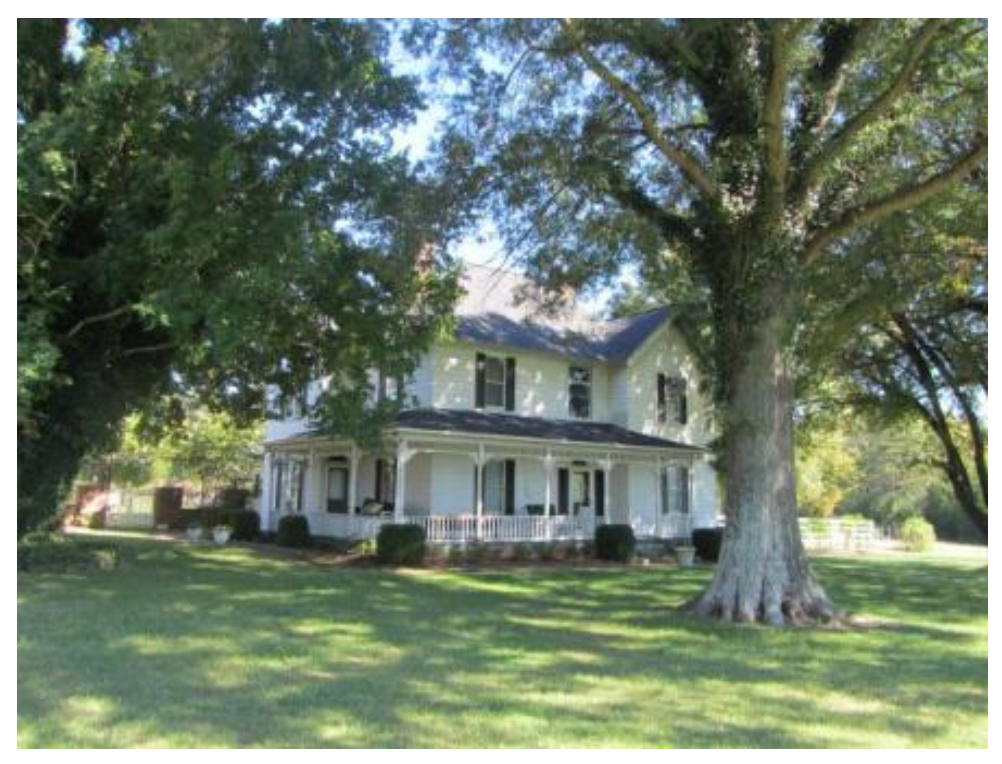
Figure 42. NCDOT Survey #29, Cyrus Augustus Wharton House (GF-2121), 6709 Burlington Road, Guilford County, south façade, looking northeast from driveway.

Outbuilding #3: A building of undetermined age or use is located to the northeast of the main house. Resting on raised stone piers, it features a front-gable roof, double-leaf wood door on the south, and wooden steps leading to the west. The roof extends over a wooden porch, and square posts support the porch.