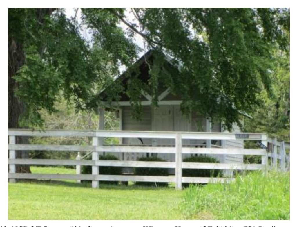
Figure 48. NCDOT Survey #29, Cyrus Augustus Wharton House (GF-2121), 6709 Burlington Road, Guilford County, outbuilding located northeast of the main house, looking north.