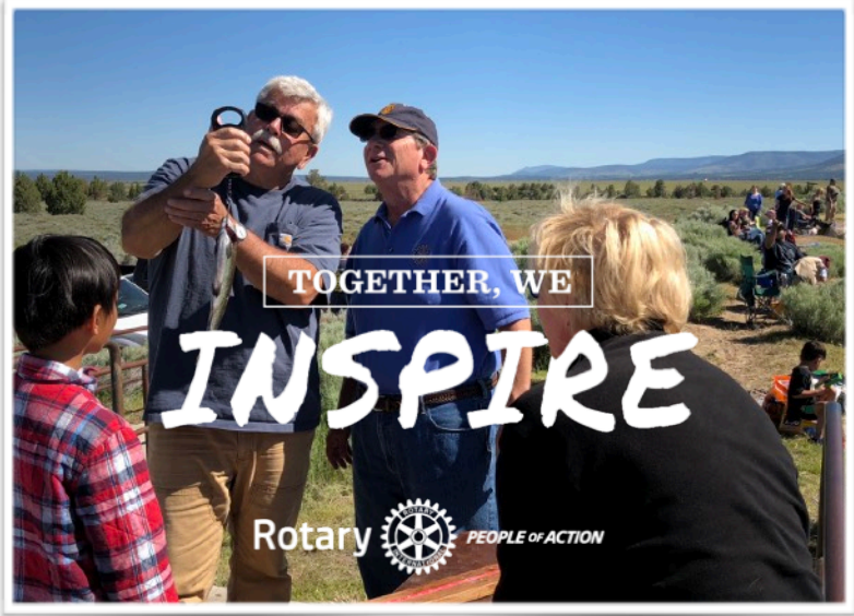
A bright, sunny morning greeted the crowd of youngsters at Pine Creek Reservoir Saturday, June 2, for the 70th annual Rotary Fish Derby.