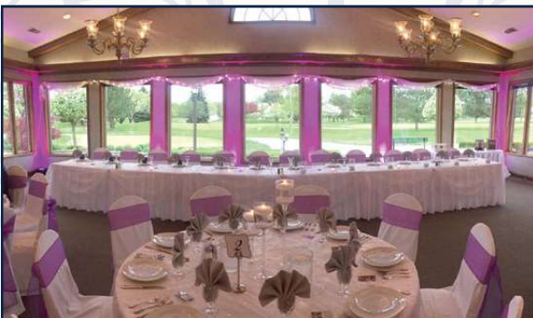
Dining room photos courtesy of Elite Entertainment