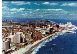
The spectacular Atlantic Ocean Shore.

Departure: St. Margaret's Catholic Church, 410 Addison Rd, Seat Pleasant, MD @ 10 am