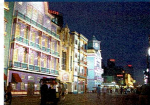
Enjoy the world-famous Boardwalk.