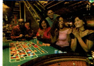
World-class gaming in Atlantic City awaits!