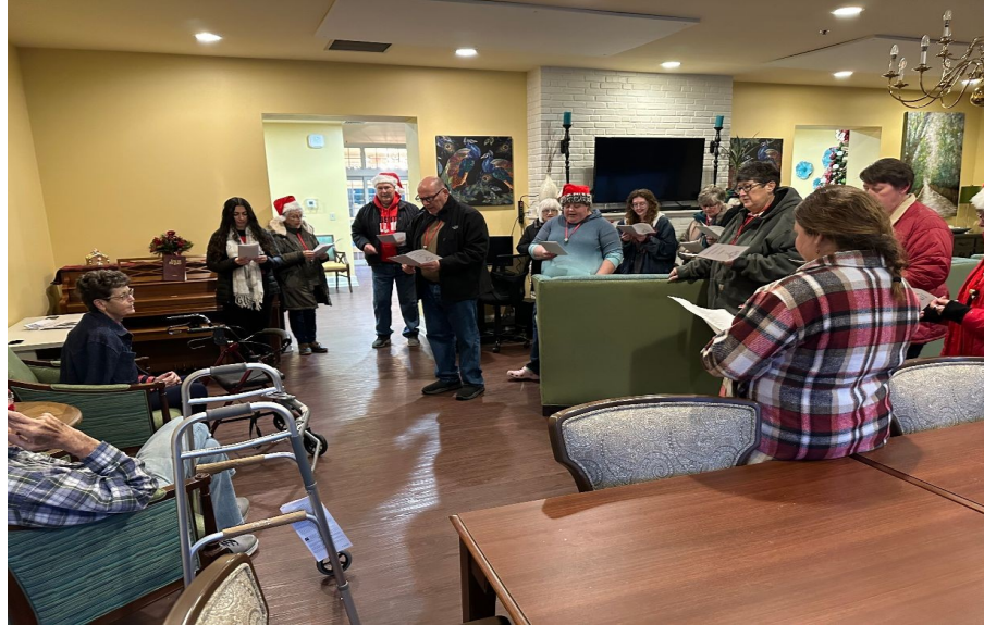
Caroling at Penn Hall 2023