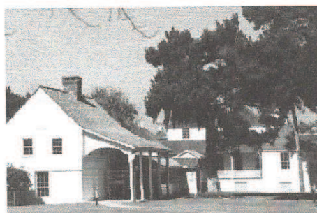
Kingsley Plantation National Historic Site