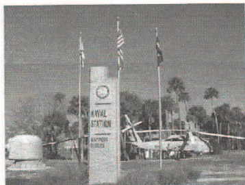
Mayport Naval Station

Come enjoy the history and culture of the largest city in the continental United States! Your professional tour guide meets the group at your hotel for a river city experience that will entertain all your senses. Our first stop this morning is at Mayport Naval Station; a major Navy base that has grown to become the third largest fleet concentration in the U.S. (i.e. Cruisers, Destroyers, and Frigates). We will take a driving tour with our base guide who takes us past the barracks with the million dollar view, the fire trainer, the wet trainer, air operations and the ship basin. Lunch will be at a base conference center along the ocean. After lunch, we drive to Downtown Jacksonville for a short driving tour. You will hear the exploits of the city's namesake, Andrew Jackson, and the famous architects who descended upon the city after the Great Fire of 1901. We will stop to disembark at our Jacksonville Memorial Wall to pay tribute to our fallen veterans and hear the stories of the local heroes. Your guide creates an interactive tour atmosphere which is fun for everyone.