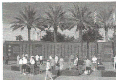
Veterans Memorial Wall