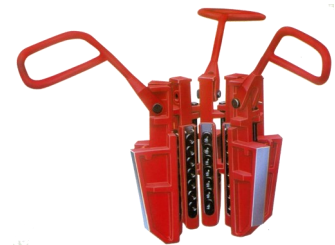
Drill Pipe Slip