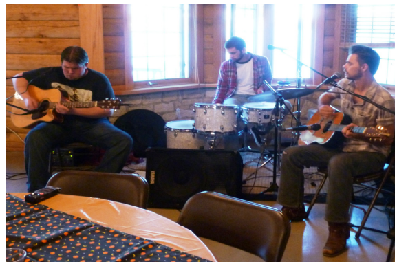
The Orange Whips perform at Octoberfest

The Lake Bloomington Association hosted an Octoberfest for lake residents Saturday October 21st at the Davis Lodge. Approximately fifty folks enjoyed brats and hotdogs provided by the LBA. Lots of catching up with neighbors occurred while listening to the music provided by the Orange Whips. Children in attendance were able to participate in various arts and crafts projects. A rousing "Bags" competition highlighted the days events. Thanks to all who helped make the social possible. And a big thanks to all who attended.